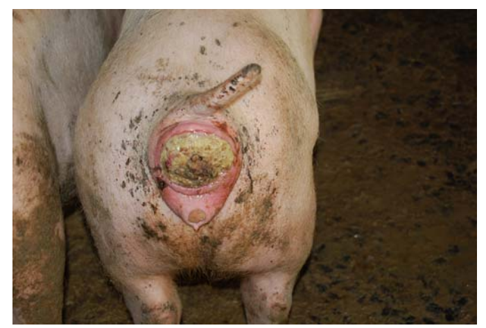
Fig.2. Prolapse and accentuated necrosis of the rectal mucosa in swine.