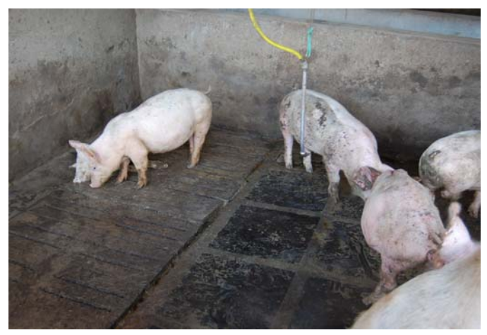
Fig.1. Accentuated abdominal distension in swine.

Intestinal samples were collected and sent to the Laboratory of Veterinary Bacteriology at UFRGS. Attempts to isolate the agent were conducted by both direct plating and selective sample enrichment [modified ISO 6579 protocol]. Briefly, 1g of each sample was homogenized in 10ml of Buffered Peptone Water and incubated at 37°C. After overnight incubation 100 µl aliquots were transferred to tubes containing 10ml of Rappaport-Vassiliadis Salmonella enrichment broth (Accumedia Manufactures Inc. Lansing, Michigan, USA) and incubated at 42°C for 16-20 hours. Subcultures from the enrichment broths were plated on Rambach agar and incubated at 37°C for 24 hours. Suspected colonies were isolated and identified through traditional biochemical reactions, agglutination with Polyvalent Salmonella O antisera (Difco, Detroit, Michigan) and API 20E strips (bioMérieux Inc., Durham, NC, USA). Antimicrobial